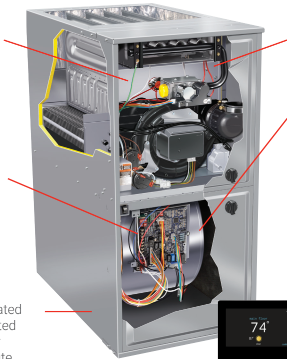
90% Gas Furnace

Quiet – Solid, pre-painted steel insulated cabinet with tight-fit door latch, isolated blower motor, and soft-mount rubber gaskets on key components contribute to quieter operation.